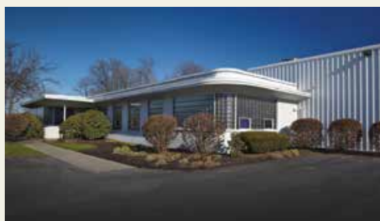
Union City, PA